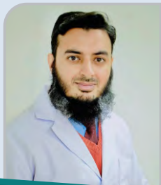
Dr. Israr Ahmad